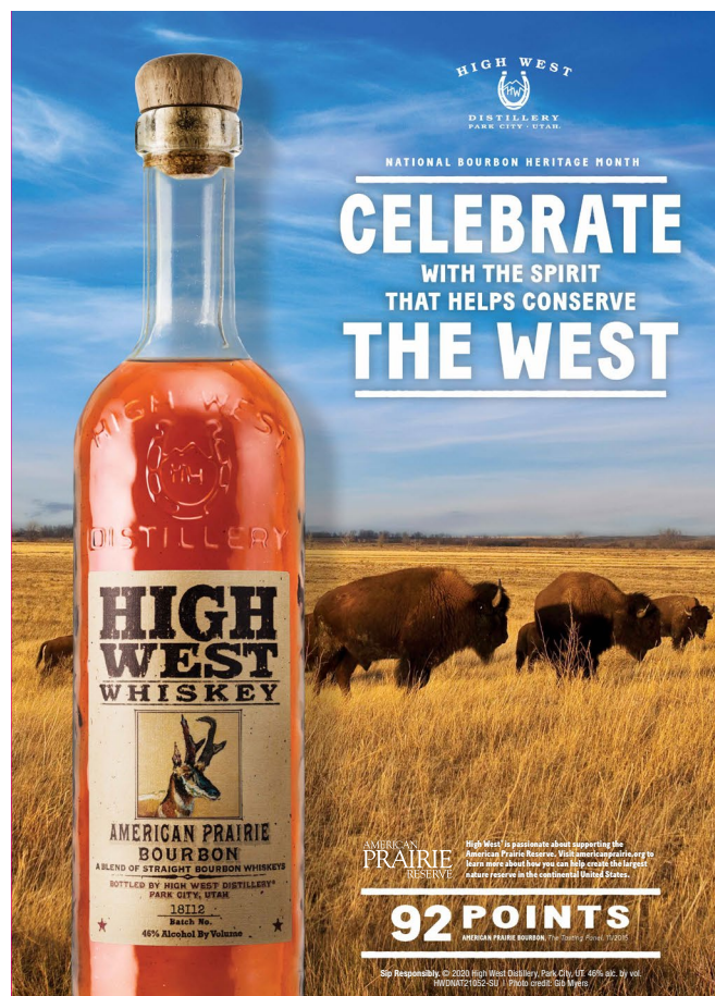
Figure 2. American Prairie Bourbon Poster

The partnership between High West and APR has boosted brand visibility for both organizations. In fact, the marketing aspect of the partnership might be the biggest draw for High West and Constellation Brands. Constellation sees the partnership with APR as important because by telling the APR story the company can further differentiate High West as a western whiskey brand. The partnership also helps ensure that High West’s claims about supporting the West are credible: “Consumers and media appreciate that High West invests in real land and people,” says Erickson. 50 Figure 2 shows a poster Constellation designed and placed in stores throughout the country in honor of National Bourbon Heritage Month.